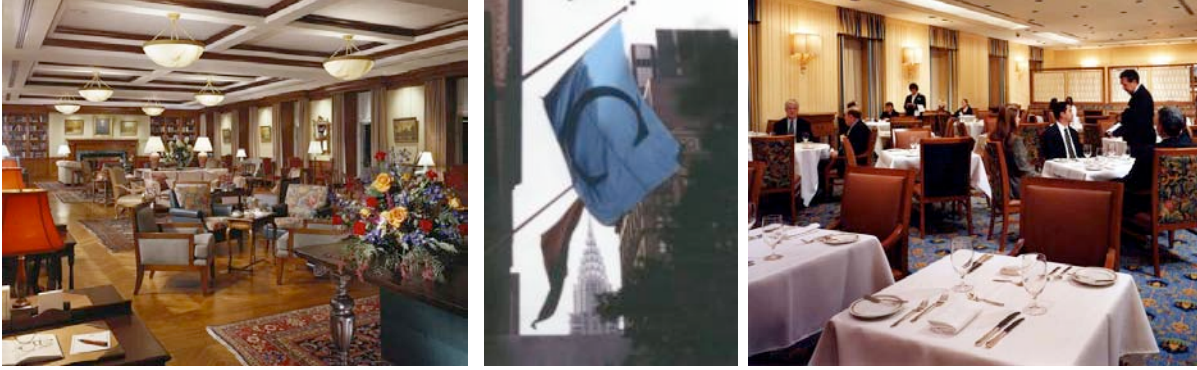
Some of the renovated spaces at the Clubhouse.