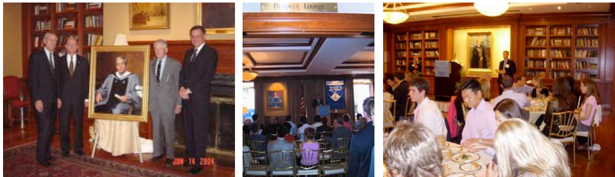
Some recent Club happenings...